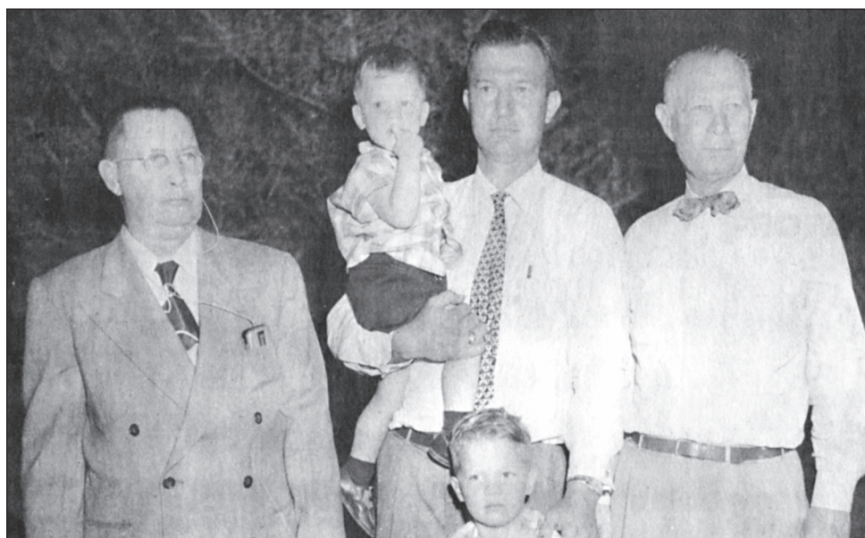
From The Liberty Gazette, Thursday, May 4, 1972 -