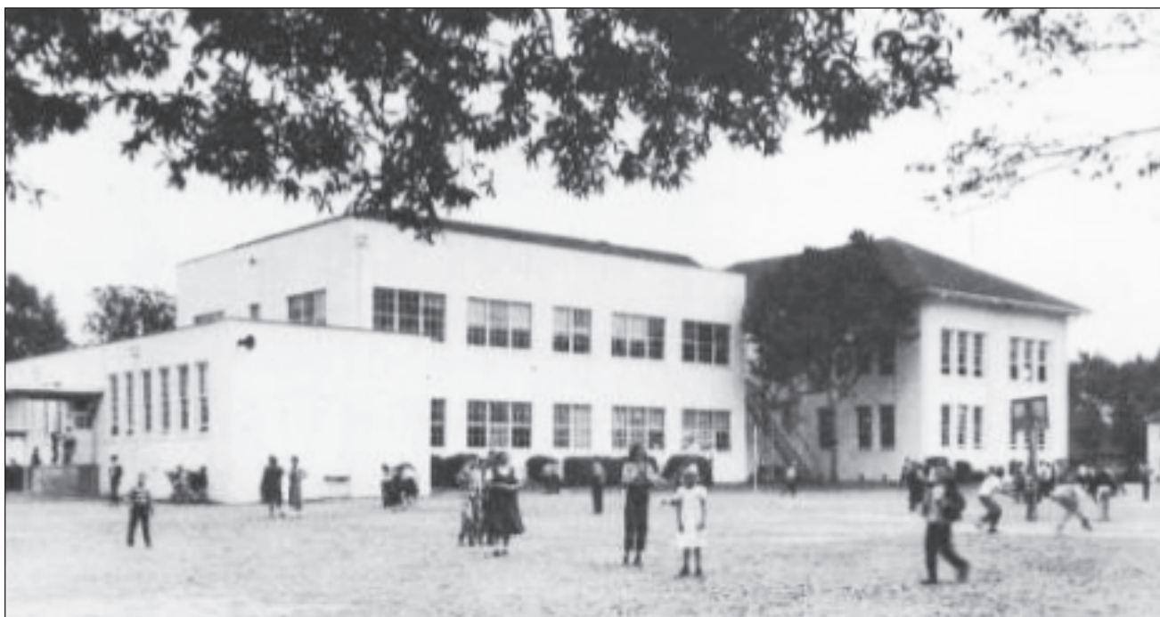
Sam Houston Elementary School, 1952 Above: East playground and building Below: West entrance of annex