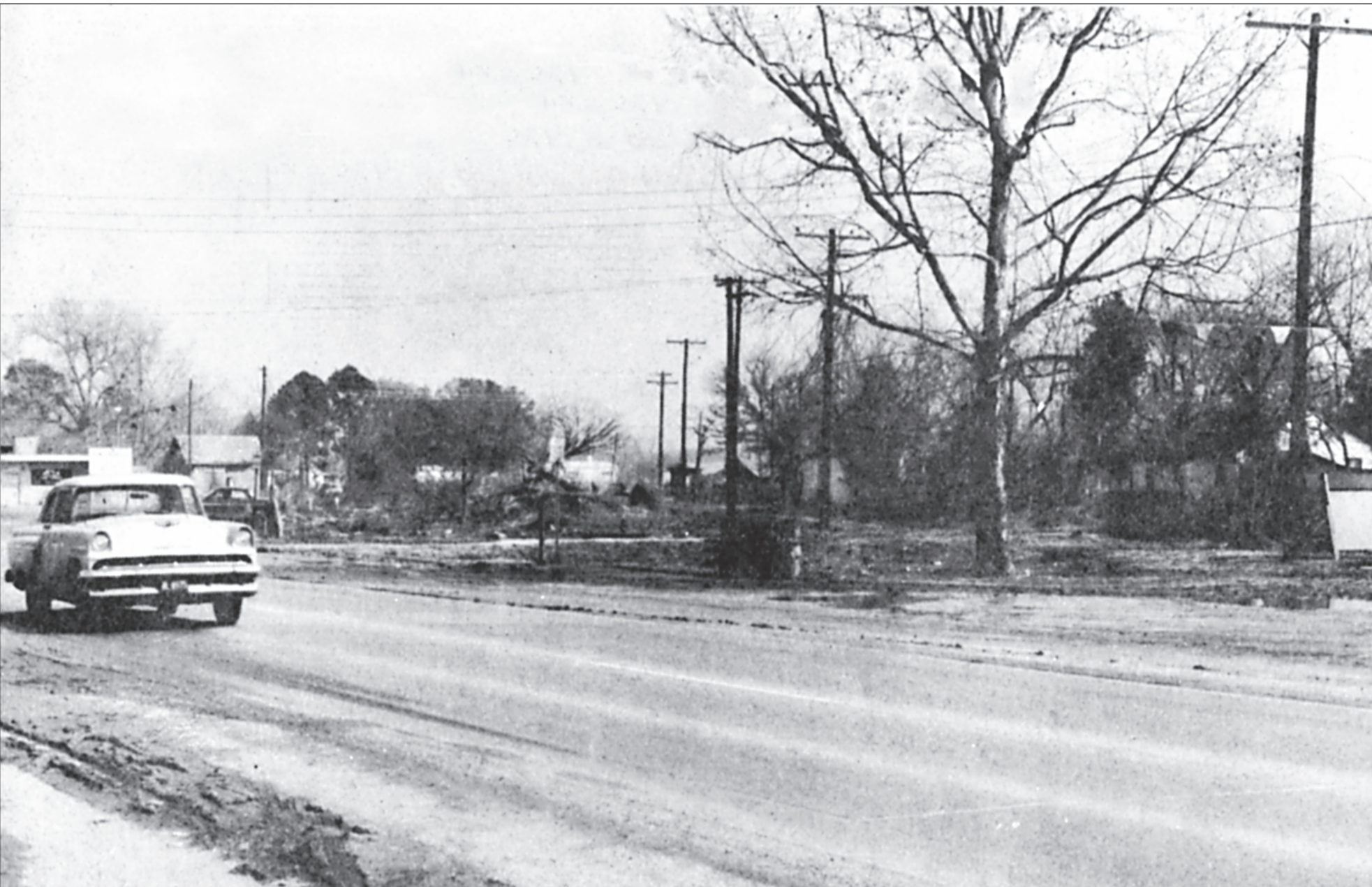
From Illustrated Press of Liberty County, Thursday, February 21, 1963 – Right-of-way for new Highway 90 in western Liberty is being cleared of the last remaining buildings. It turns southward toward Santa Anna Avenue at this point in front of Majors’ Superette. All four lanes will follow Santa Anna to the eastern side of Liberty.