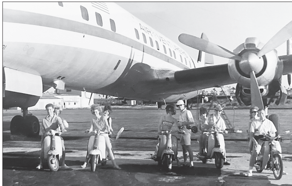
Happy club members at one of our island destinations.