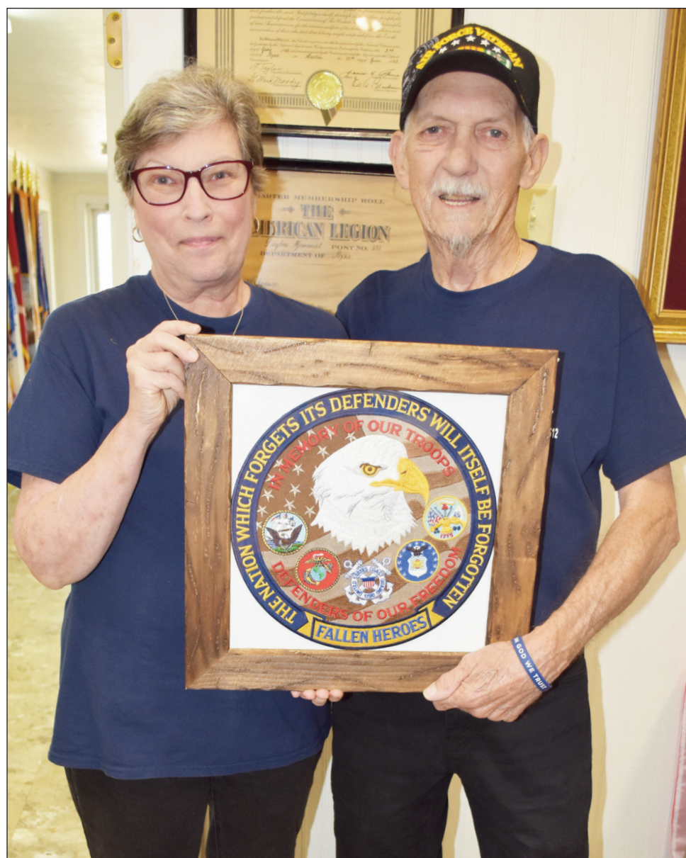
To honor our local Vietnam War Era Veterans, American Legion Dayton Memorial Post 512 served up a delicious free lunch at the post home in Dayton, Sat., March 28. Sunday, March 29, was observed as National Vietnam War Era Veterans' Day.

LIBERTY CTY. - Do you have time to lend a hand for others? Meals on Wheels of Southeast Liberty County is in need of volunteers in all of their service areas. Drivers are needed for all routes and it only takes 1.5 hours to deliver hot meals to area seniors. If you have time to lend, call 936-641-2846.