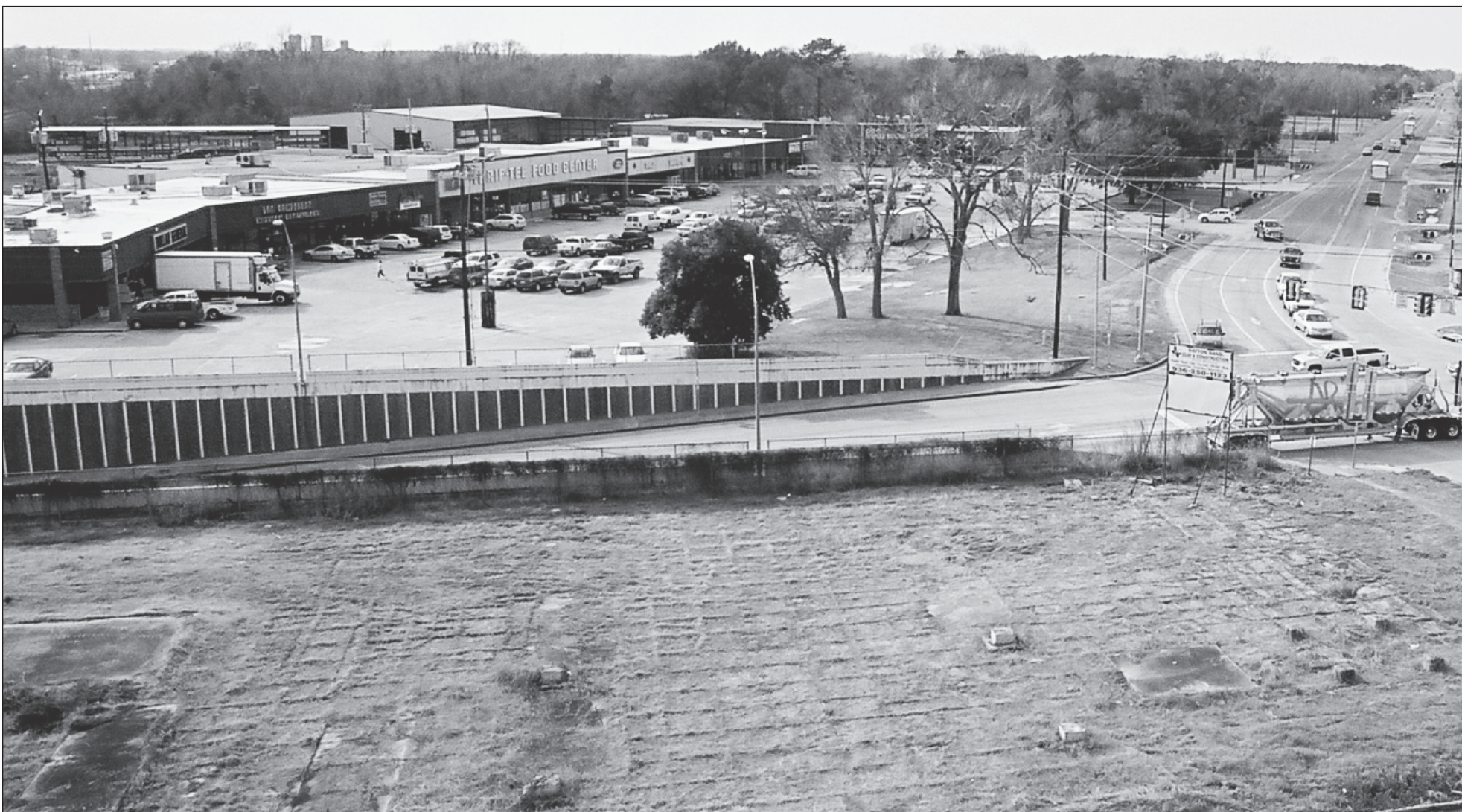
The view from atop the American Rice Growers rice dryer in Dayton offers a stunning panorama from a height of some 50 feet. Longtime residents of Dayton will remember that the concrete pad in the foreground was the location of the town electrical power plant. Thrif-Tee Food Center is at left and Hwy. 1960 stretches into the distance.

The dryer office at the American Rice Growers - Dayton Division had an impressive system for keeping up with the conveyors and storage bins. These panels in the dryer office indicated which conveyors and bins were in use. Aaron removed the one at left to save. Note that all the bins weren't cylindrical; some were oddly-shaped to fully utilize the space. The missing panel at left was removed by Aaron Holbrook to be saved for display in his office. He tells us that he removed the smallest panel because these things are really quite heavy.