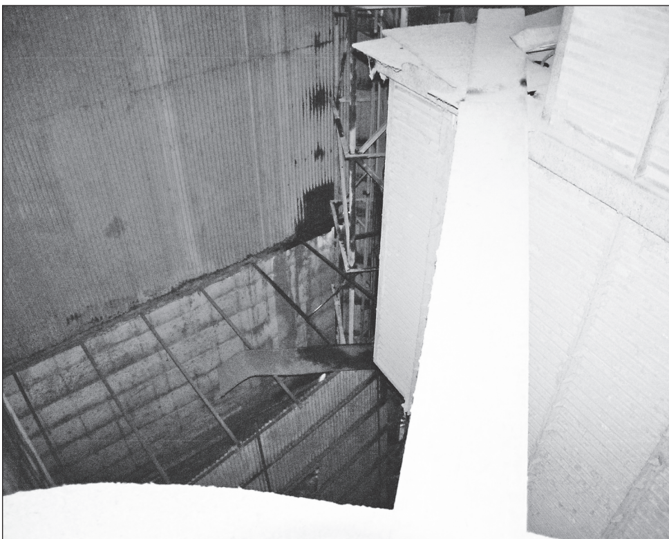
Nope, we weren't brave enough to traverse this 2x12 across the "abyss." Just took the picture and backed away.

The dryer office at the American Rice Growers - Dayton Division had an impressive system for keeping up with the conveyors and storage bins. These panels in the dryer office indicated which conveyors and bins were in use. Aaron removed the one at left to save. Note that all the bins weren't cylindrical; some were oddly-shaped to fully utilize the space. The missing panel at left was removed by Aaron Holbrook to be saved for display in his office. He tells us that he removed the smallest panel because these things are really quite heavy.